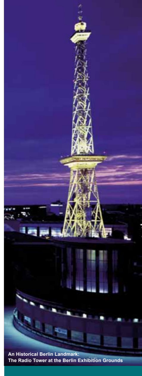
An Historical Berlin Landmark: The Radio Tower at the Berlin Exhibition Grounds

Five Fraunhofer institutes, five universities and twelve private companies have joined to form the "Fraunhofer Secure Identity Innovation Cluster", which receives support from the federal states of Berlin and Brandenburg. Their goal is to offer technologies, processes and products that help to enable the identification of persons, objects and intellectual property in the real and virtual worlds. At the Hasso Plattner Institute in Potsdam – an official university-level "Center of Excellence" – young students are given the practice-oriented training they need to become IT engineers. The Leibniz Institute for Innovative Microelectronics in Frankfurt / Oder enjoys an excellent reputation for its achievements in the development of wireless communication technologies. This tremendous diversity and excellent mix of research institutes and private companies represent the true strength of the Berlin-Brandenburg region.